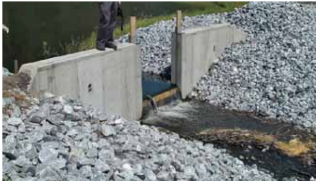
Treated water exiting the Silver Creek acid mine drainage treatment system.