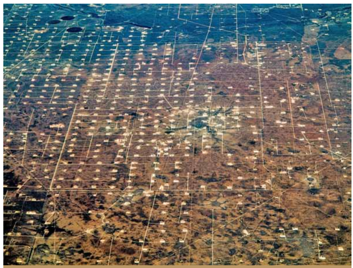
A grid of drilling sites and roads, similar to those used in fracking, lies across the landscape near Odessa, Texas.

In the years to come, fracking may affect a much bigger share of the landscape. According to a recent analysis by the Natural Resources Defense Council, 70 of the nation's largest oil and gas companies have leases to 141 million acres of land, bigger than the combined areas of California and Florida.<sup>113</sup> More-