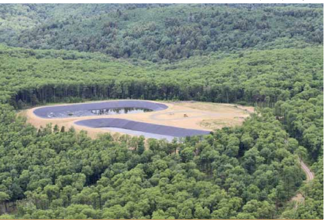
Fracking wastewater is often stored in open waste pits such as these, near Summit, Pennsylvania. Leaks from pits can contaminate drinking water supplies.