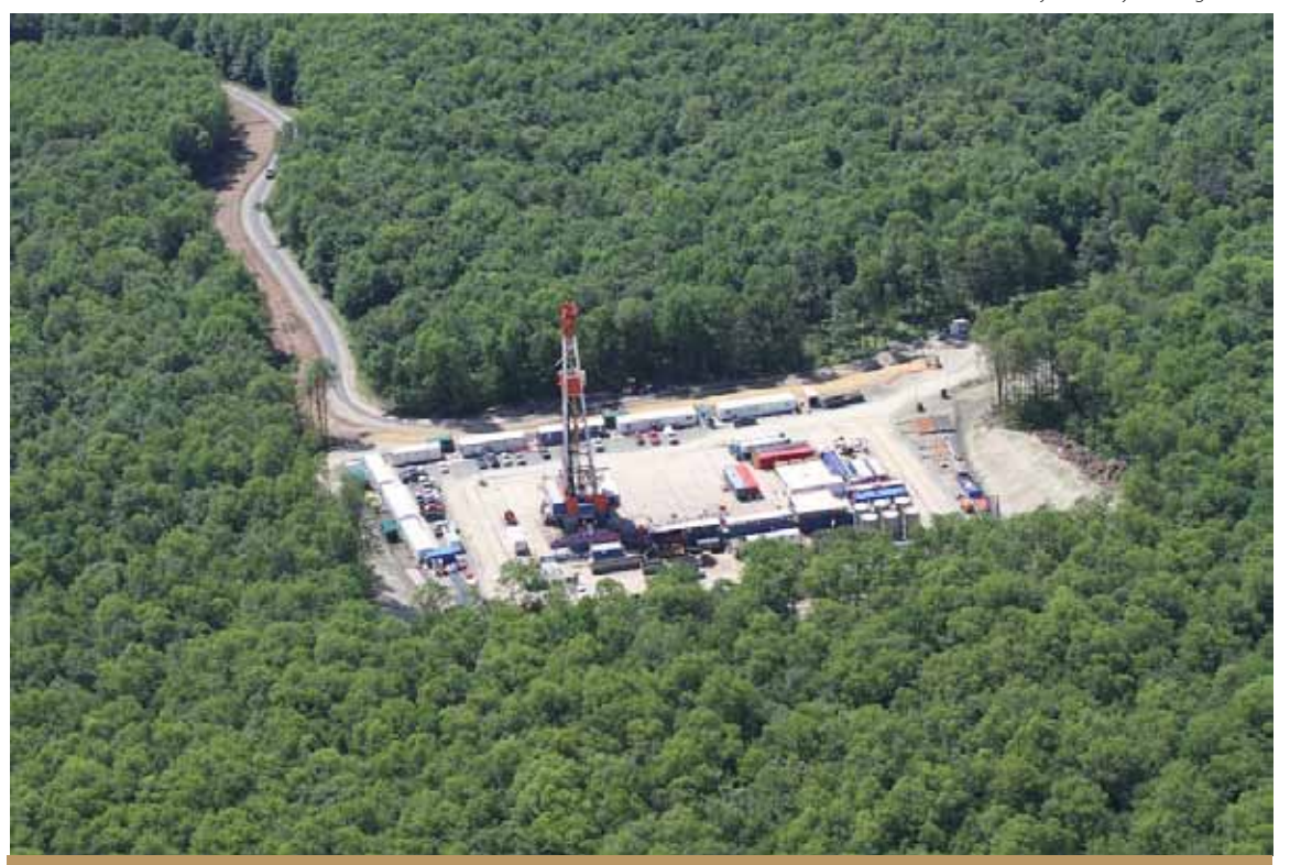
More than 6,000 shale gas/liquids wells, such as this well site in Tioga County, have been drilled in Pennsylvania since 2005.